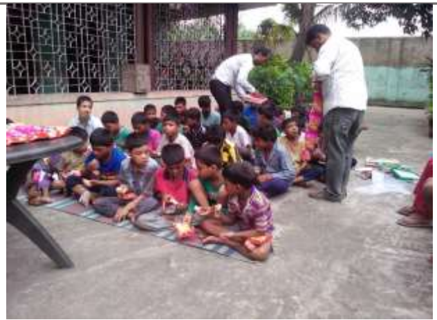
Distribution of Biscuits, sweets and kurkure due to demands of residential children.