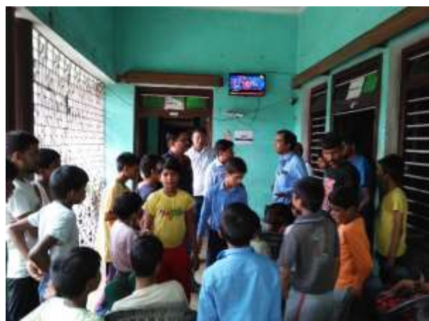
Celebration of "Christmas Day" in the campus of Children Home (Boys):-