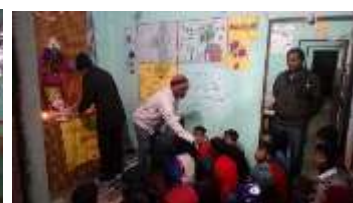
Saraswati Puja in Residential Children Home (Boys), Rohtas. Children had enjoyed a lot on the occasion of Basant Panchami