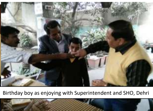
Birthday boy as enjoying with Superintendent and SHO, Dehri